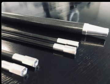
Integral 'no-bond' fittings