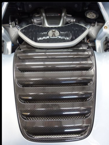
High temperature resistance

Layup time is expedited with snap-cure resins and tools can be ramped in temperature rapidly, meaning cure times of minutes, not hours.